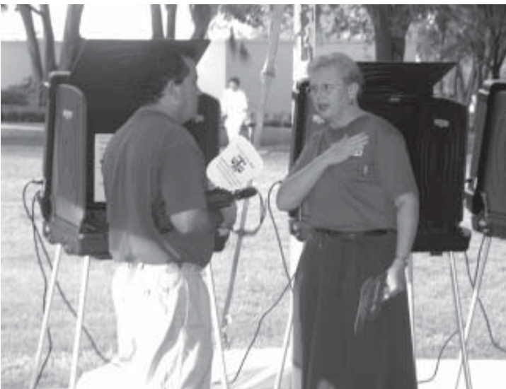
Pasco County Staff member gives instruction to voter.