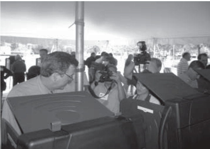
Governor Jeb Bush receives instructions on touch screen voting.

Event staff and attendees praised the new machines and welcomed the opportunity to experience the latest in voting trends.