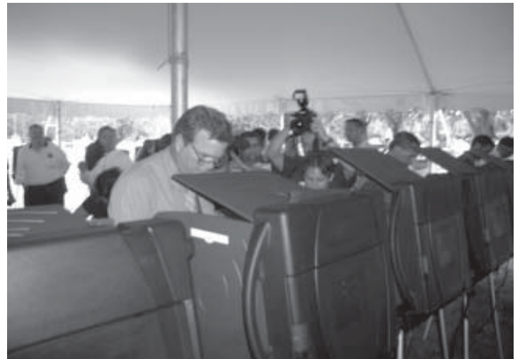
Governor Jeb Bush votes on the iTronic.