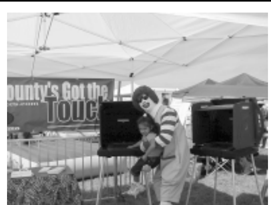
Wesley Chapel Community Festival attendees, including Ronald McDonald, tried their hand at touch screen voting. Check out pascovotes.com for a list of upcoming demonstrations.