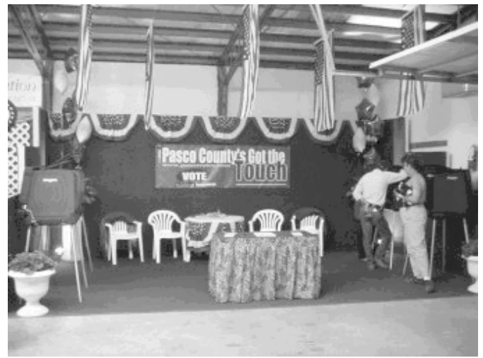
The 2002 Pasco County Fair provided an opportunity for voters to receive a "hands-on" demonstration of the new touch screen voting system.