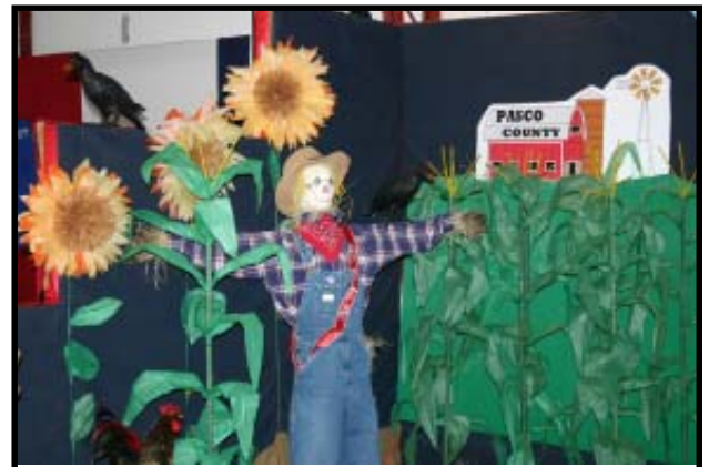
A proud scarecrow stands guard over the fair booth.

interested in joining our pool of volunteers and assist at one of our events, such as the fair, please call the office and ask for Louise. ■