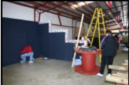
Preparations begin Friday morning before opening day Monday.

This year's Pasco County fair theme "Something to Crow About", gave opportunity for us to "crow about" the success of the 2004 election cycle, and other "crow-worthy" accomplishments such as our voter education program, our poll worker training program and special events in which we have participated.