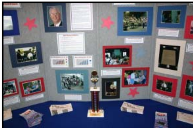
Display board of "Things to Crow About."