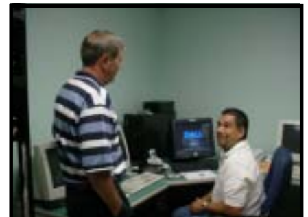
Election Systems & Software technician confers with elections staff at the Election Support Center in Dade City.

Pasco County is committed to continually providing refined and improved voting methods as technology evolves. ■